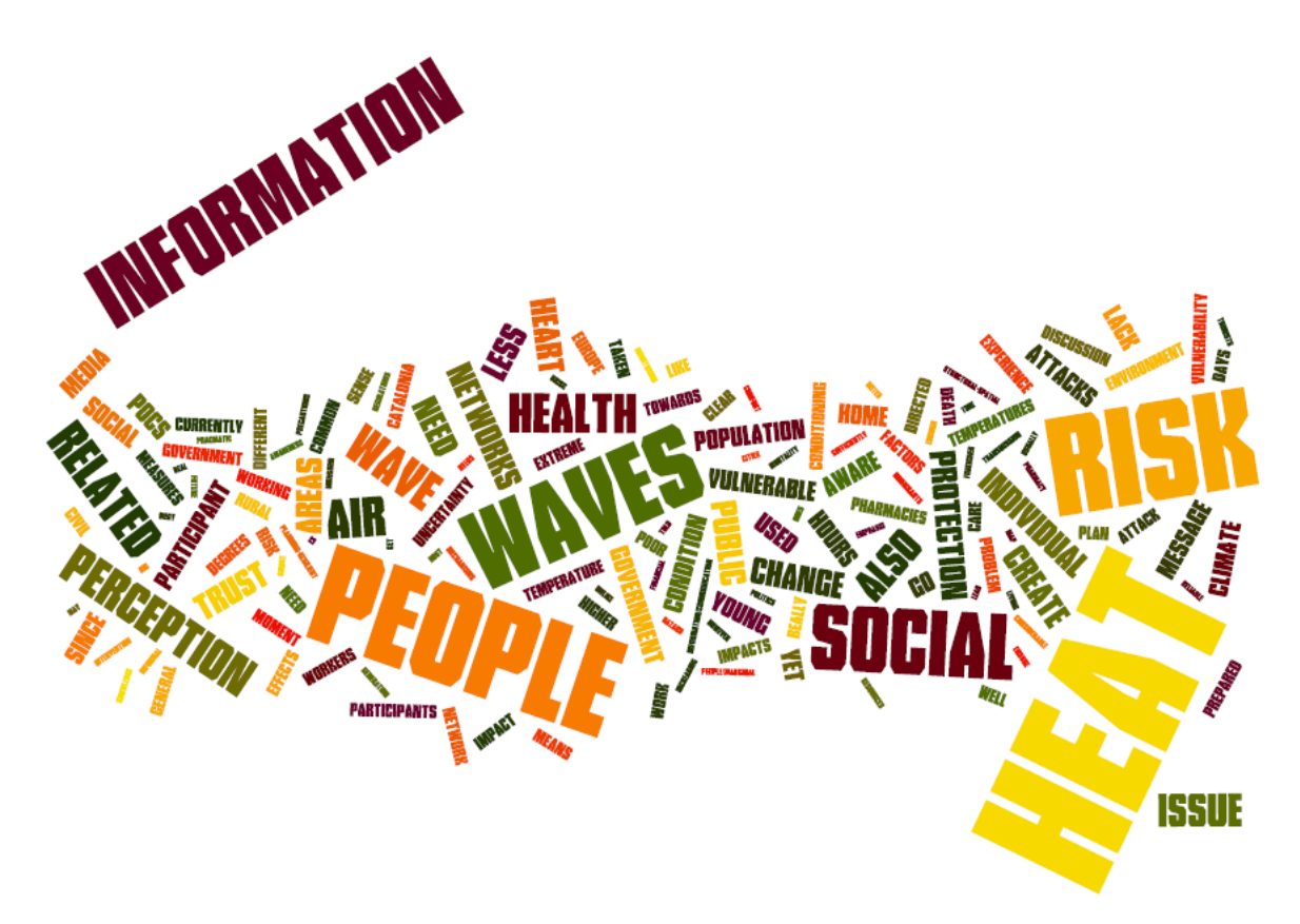
Figure 5.3: Visual summary of the minutes in the heat waves discussion

<sup>30</sup> An emphasis made in the CapHaz-Net WP4 report (Tapsell et al. 2010).