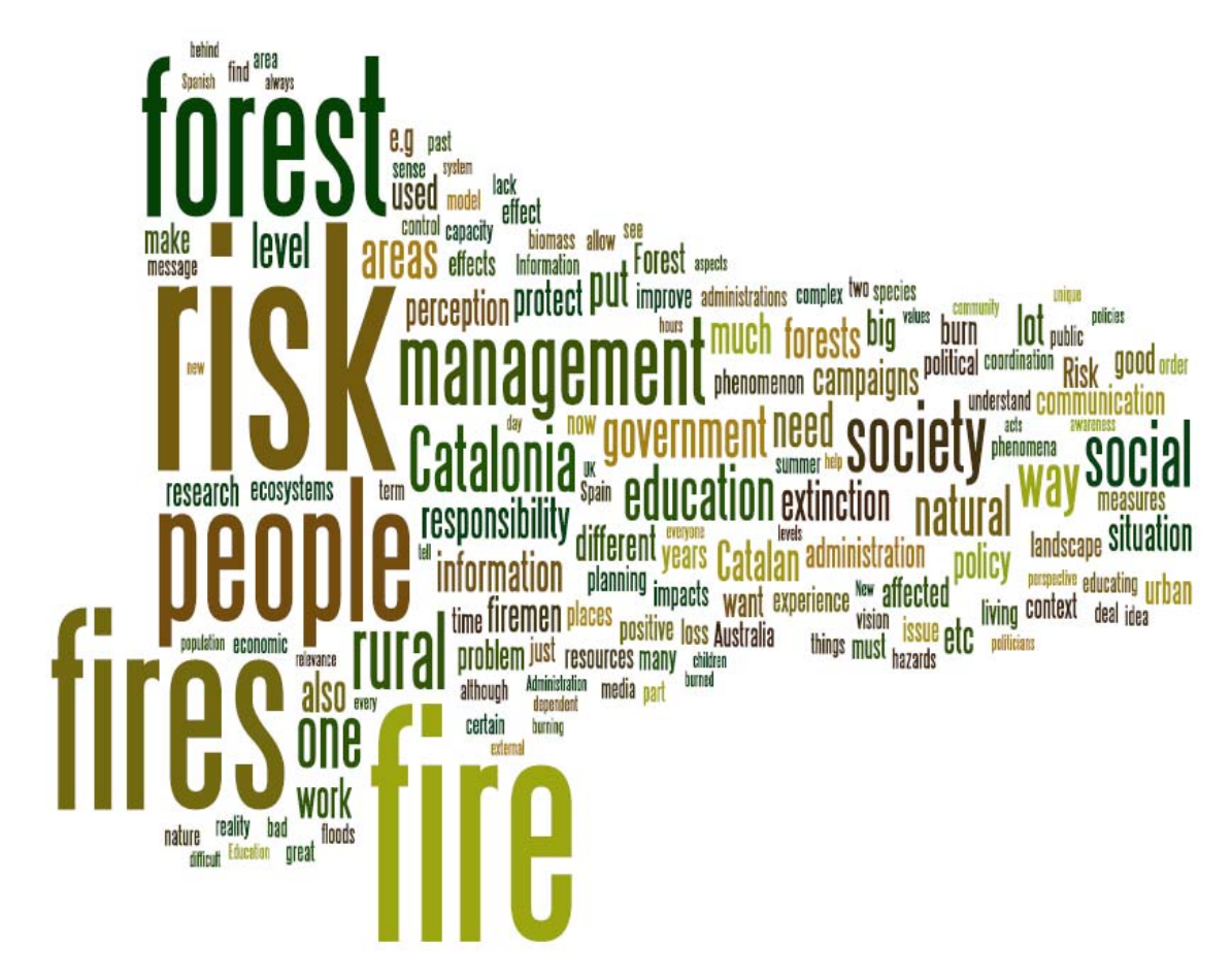
Figure 5.2: Visual summary of the Minutes in the forest fires discussion

An interesting comment which relates to the learning practices was mentioned as a positive impact of forest fires. Community and the institutions would be involved in this learning dynamics. However, the transition from (current) 'zero-risk' paradigm to (desirable) 'living with fire' paradigm<sup>26</sup> is still a very slow process. An on-going learning process from past experiences should help complete the transition to a co-existence paradigm in which citizens' self-responsibility and experience sharing would play an important role, as well as the identification of implementable rather than possible (but not realistic) solutions. The paradigm shift implies a discourse evolution which is indicative of the social construction of risk idea, which didn't emerge in the other groups.