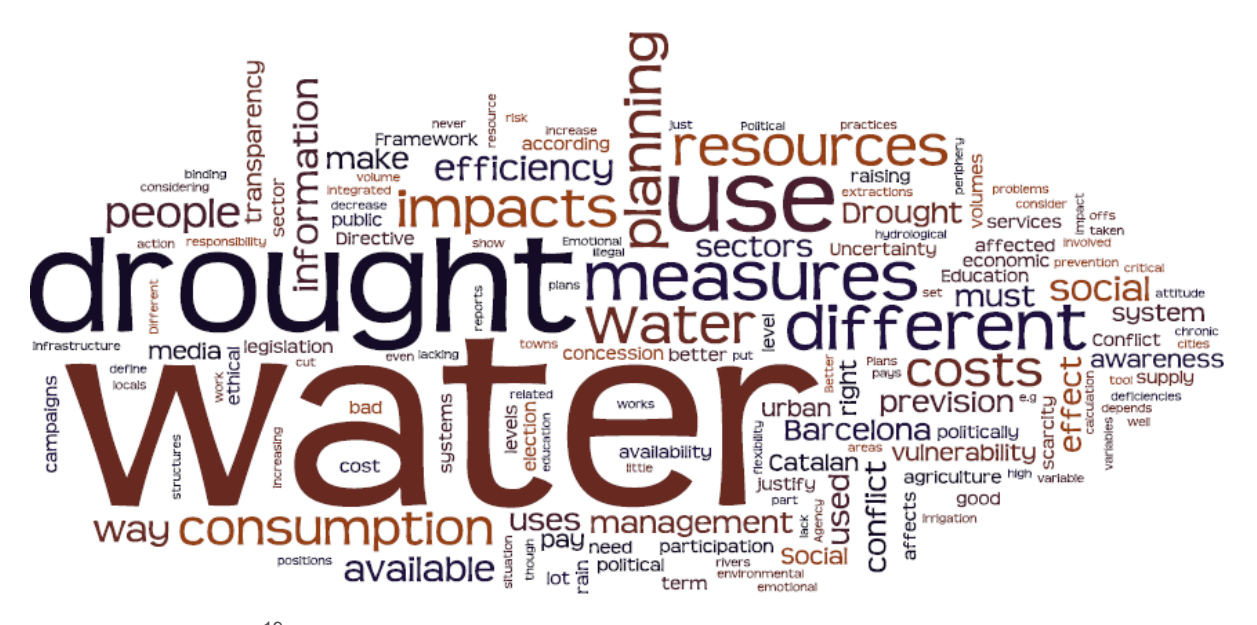
Figure 5.1: Visual summary <sup>19</sup> of the minutes in the drought discussion

In Table 3.1.1 the main outcomes of the group session are organised by levels<sup>20</sup> on the Y axis and discussion questions in the X axis. Participants highlighted that droughts affect mainly the individual and social level. It has immediate economic impacts (industry and agriculture) and subsequently raises conflicts between sectors and the debate over rights and use efficiency. As stated by a participant in the drought group, individually there is a steadily increasing awareness of the risk which has triggered a cultural shift towards water consumption and demands for alternative water management policies<sup>21</sup>. For their part, institutions are making an effort to promote self-responsibility among citizenship through risk communication and education through water use campaigns, access to information and weather forecasting<sup>22</sup>. Overall, the impact, and therefore the vulnerability to the hazard, depends on many different factors: water uses, the degree of urbanisation, water management policies in the area, etc.