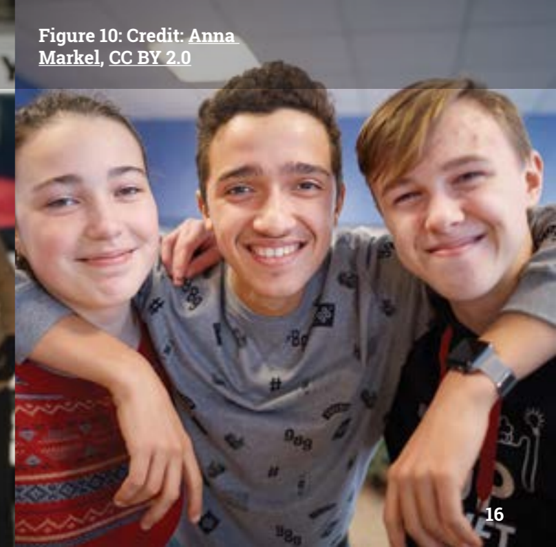
Figure 10: