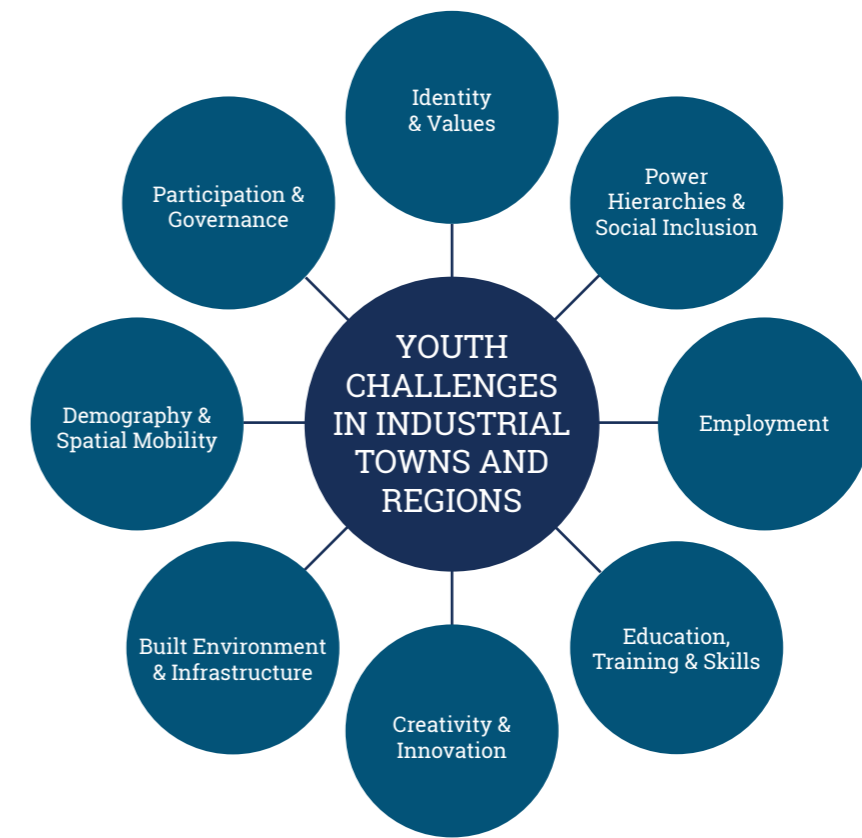
Figure 2: Youth challenges in industrial towns and regions (adapted from Kozina et al. 2021)

parts of developed countries in Europe, North America and Australia. From this research, eight such challenges were identified. The literature discusses the various challenges present at different levels, and the relationship between industrial towns and youth is often described as 'problematic' – this should be kept in mind when reading and interpreting the current section, which discusses the topic in more general terms. There are various industrial towns in the SI-AT cooperation area, each with its unique problems and advantages. Therefore, this paper discusses the challenges faced by most industrial towns to a certain degree, but these may not apply to all industrial towns per se. Accordingly, some readers might fully recognize the following challenges, while others might do so only partially.