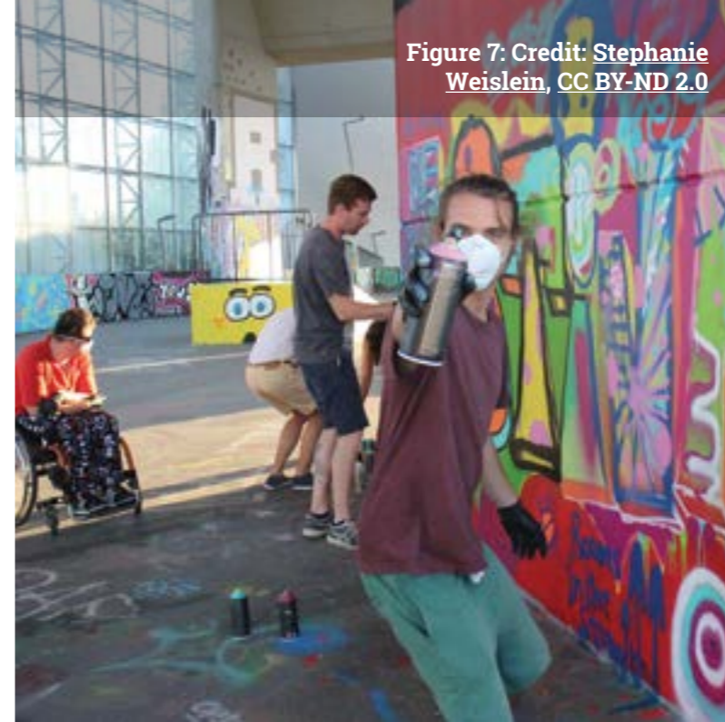
Figure 7:

Keywords: participatory planning, mutual respect, bottom-up approach, inclusiveness