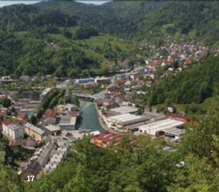
Figure 13: