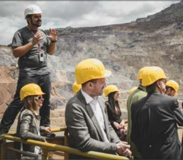
Figure 11: