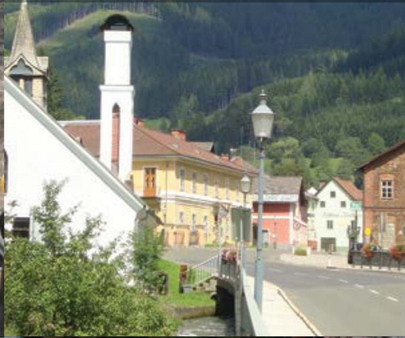
Figure 12: